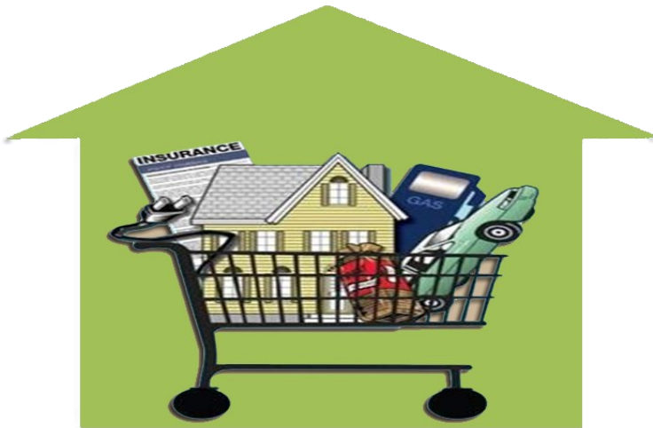
CPI or All Income Households, NCR: January - December 2017 and January 2018 (2006 = 100)

Purchasing Power of the Peso is the measure of the real value of the peso in a given period relative to a chosen base period.