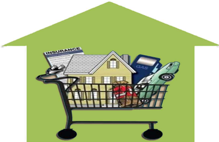
Monthly CPI for All Income Households, NCR January 2019– June 2020 (2012=100)