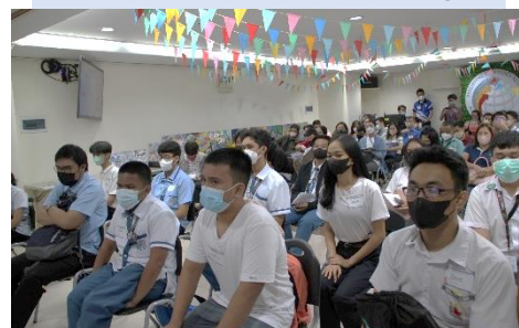
A photo of the students who participated in a different contest during the celebration in the 33rd National Statistics Month.