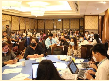
A picture of the participants during the 2021 Full-Year Poverty Statistics Data Dissemination.

On October 10, 2022, A data dissemination on the Official poverty statistics of NCR based on the results of the 2021 Family Income and Expenditure Survey was conducted by the Officials of RSSO-NCR and PSO in Santa Cruz, City of Manila. Presented on the data dissemination were the Official Poverty Estimation Methodology and NCR's 2021 Full Year Official Poverty Statistics.