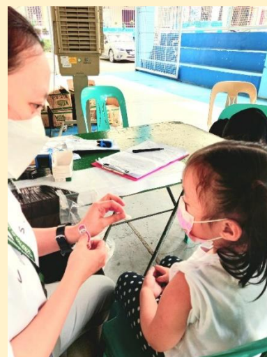
1st place winner and crowd favorite of the 2nd Mobile Photography Contest.