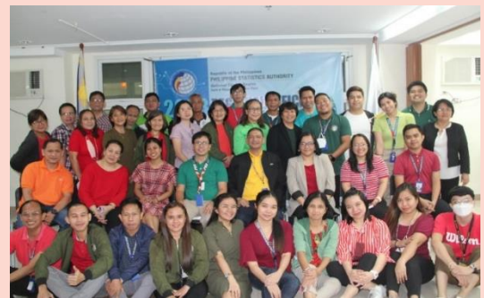
After completing the workshop at the RSSO conference room, the RSSO NCR team gathered for a photo to commemorate the event.

knowledge and skills, and foster teamwork, collaboration, and innovation. By setting a solid foundation for the upcoming year, the organization is better equipped to achieve even greater success.