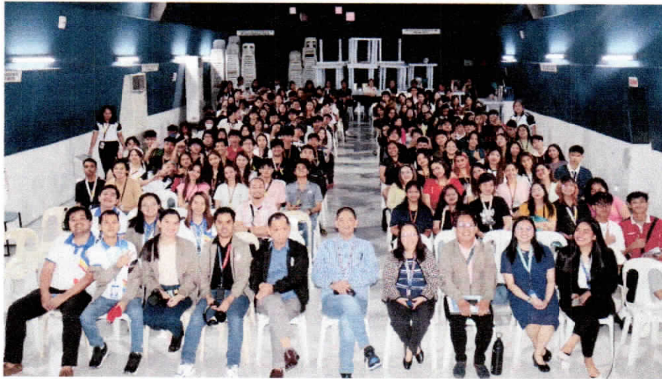
PSA-NCR Officials and Staff with Faculty and students from Polytechnic University of the Philippines

Date of Release: 27 February 2025 Reference No. 2025-PR-04