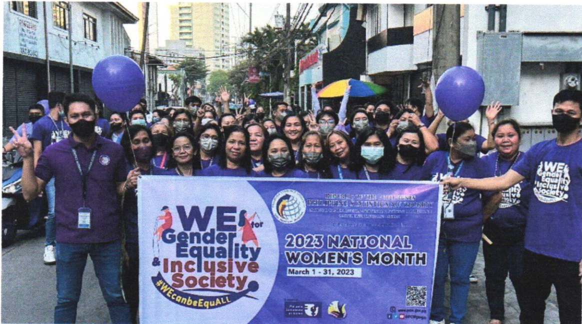
(PSA NCR PSO III Staff posing before the parade)

08 March 2023 – CITY OF MAKATI, Philippines. The Philippine Statistics Authority National Capital Region Provincial Statistical Office III (PSA NCR PSO III) took to the streets of Barangay San Antonio, Makati City to join the nation in the celebration of the 2023 National Women's Month and National Women's Day last March 8, 2023.