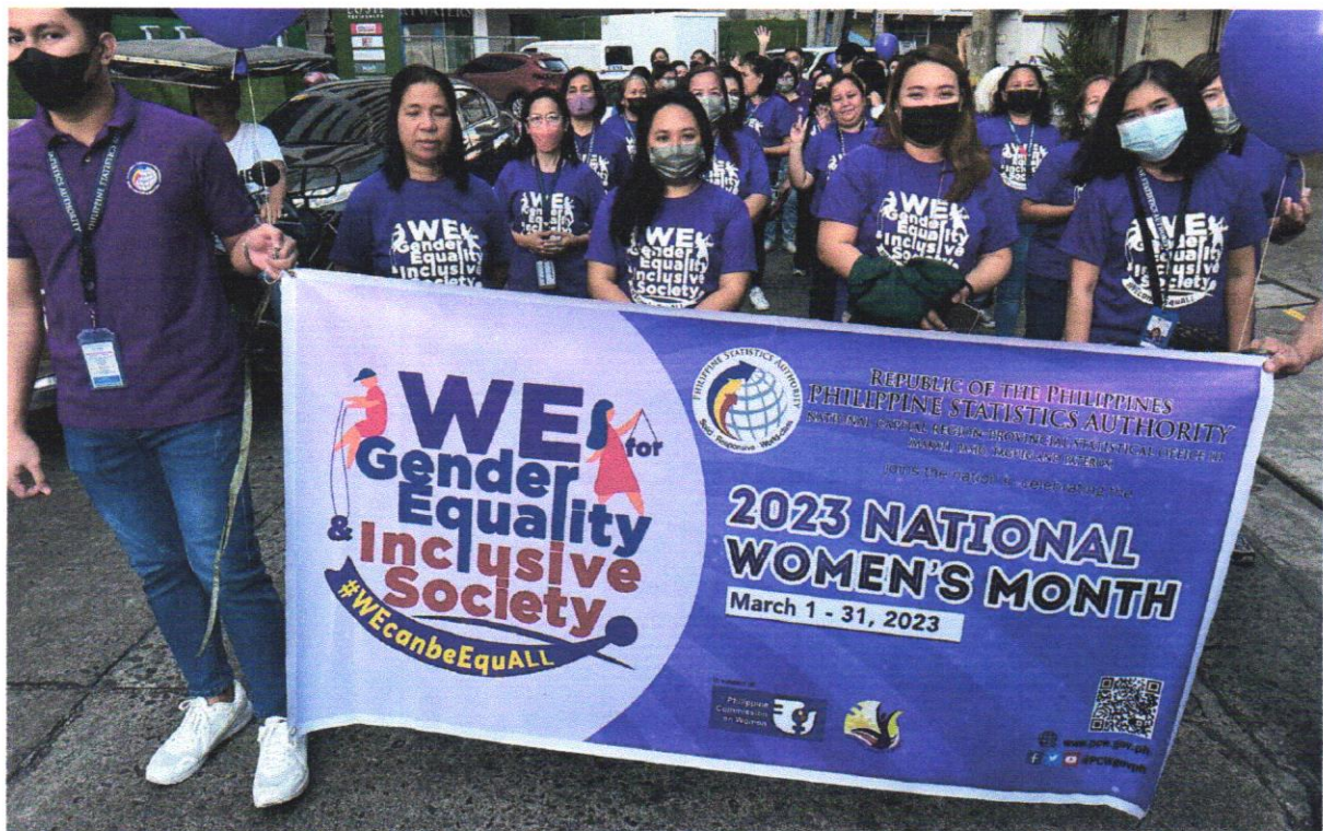
(The women of PSA NCR PSO III leading the parade)

The PSA NCR PSO III parade was led by the women of the office who delivers relevant and reliable statistics, efficient civil registration services and inclusive identification system for equitable development towards improved quality of life for all. This event was held in commemoration of all the achievements and contributions of women to our society and to highlight the role of women in the pursuit of gender equality and empowerment.