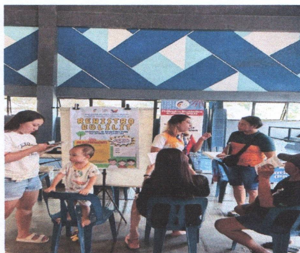
National ID Personnel during Step 2 Registration and Issuance of ePhilID