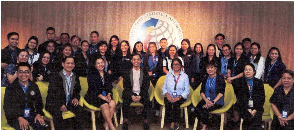
Photo Opportunity during the Training-Workshop on Data to Benchmark Estimates with representatives from the PSA central office and NCR's regional and field offices.

Date of Release: 05 April 2024 Reference No. 2024-PR-13-003