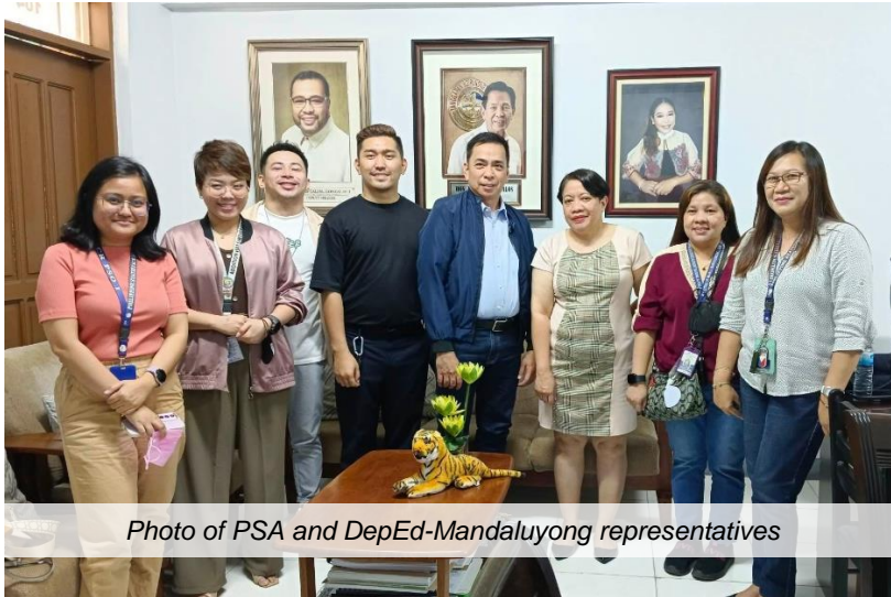
Photo of PSA and DepEd-Mandaluyong representatives