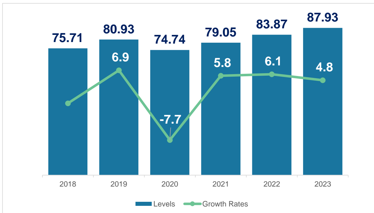
Figure 1. Gross Domestic Product of City of San Juan In Term of Levels (in Billion PhP) and Growth Rate (in Percent) At Constant 2018 Prices, 2018 to 2023

The economy of City of San Juan grew by 4.8 percent in 2023 from its 2022 level, a slower growth was experienced than the 6.1 percent in the previous year. The Gross Domestic Product (GDP) of City of San Juan was estimated at PhP 87.93 billion, PhP 4.06 billion higher than the previous year. (Figure 1)