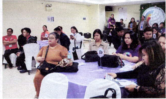
Photo of the participants during the Regional Data Dissemination Forum on Women and Men in NCR.

26 March 2025 – QUEZON CITY. As part of the National Women's Month Celebration, the Philippine Statistics Authority - National Capital Region (PSA-NCR) hosted a Regional Data Dissemination Forum on Women and Men (WAM) in NCR held at the Conference Room, 9 th Floor EDSA Grand Residences, Quezon City. Participants during the activity were representatives from Local Government Units (LGUs) and Regional Line Agencies (RLAs) to discuss the latest gender statistics and their implications for policy and program development.